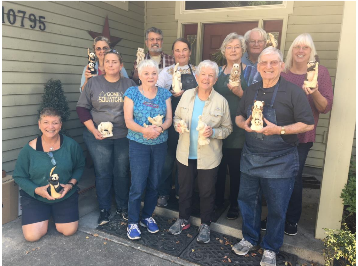
Article submitted by: Don Fromherz

After four days of flying chips, some amazing pieces emerged from those blocks of wood. Visit: hajny.fineartworld.com , to see some of her works.