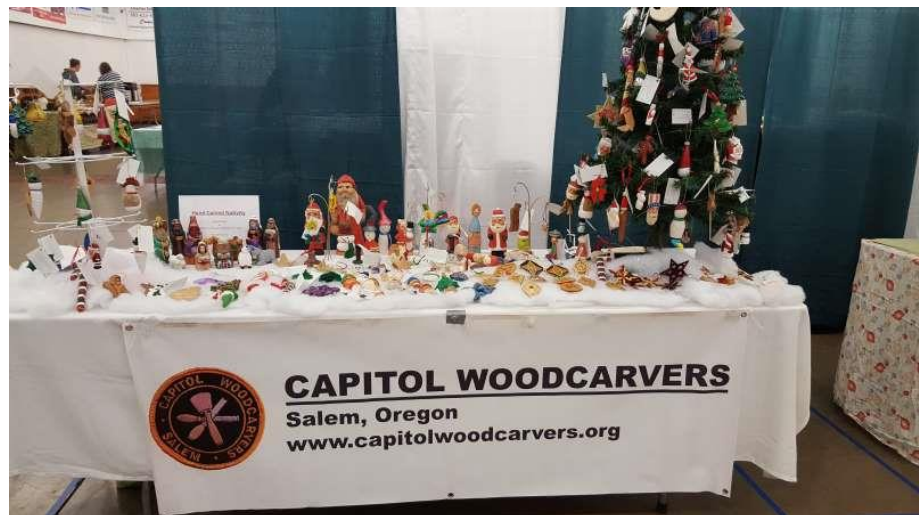
Club Ornament Sale Table

This is our club's only fund-raising event and member participation is greatly appreciated.